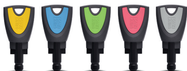
Keys, available in 5 colours