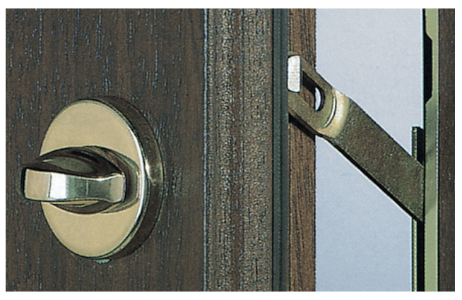
EntryGuard™ illustrated in the open position