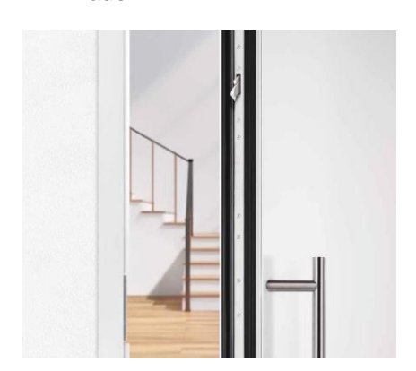
Photo 6: Doors are automatically locked mechanically with the Winkhaus blueMatic EAV3 security door system and can be opened motorised.

*Up to RC2 possible | **Source: Study by the Technical University of Münster.