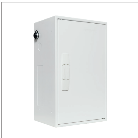
TAP wiring box 230 V

Wiring box for a safe and expert connection of blueChip und blueSmart upload readers.