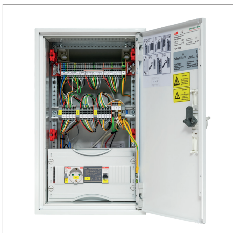
TAP wiring box 230 V